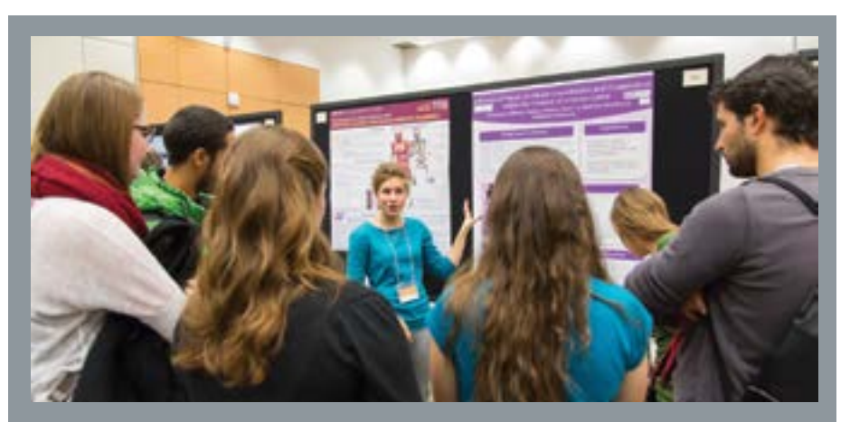
UNDERGRADUATE STUDENT RESEARCH AWARDS POSTER SESSION

department of chemical engineering. \blacksquare